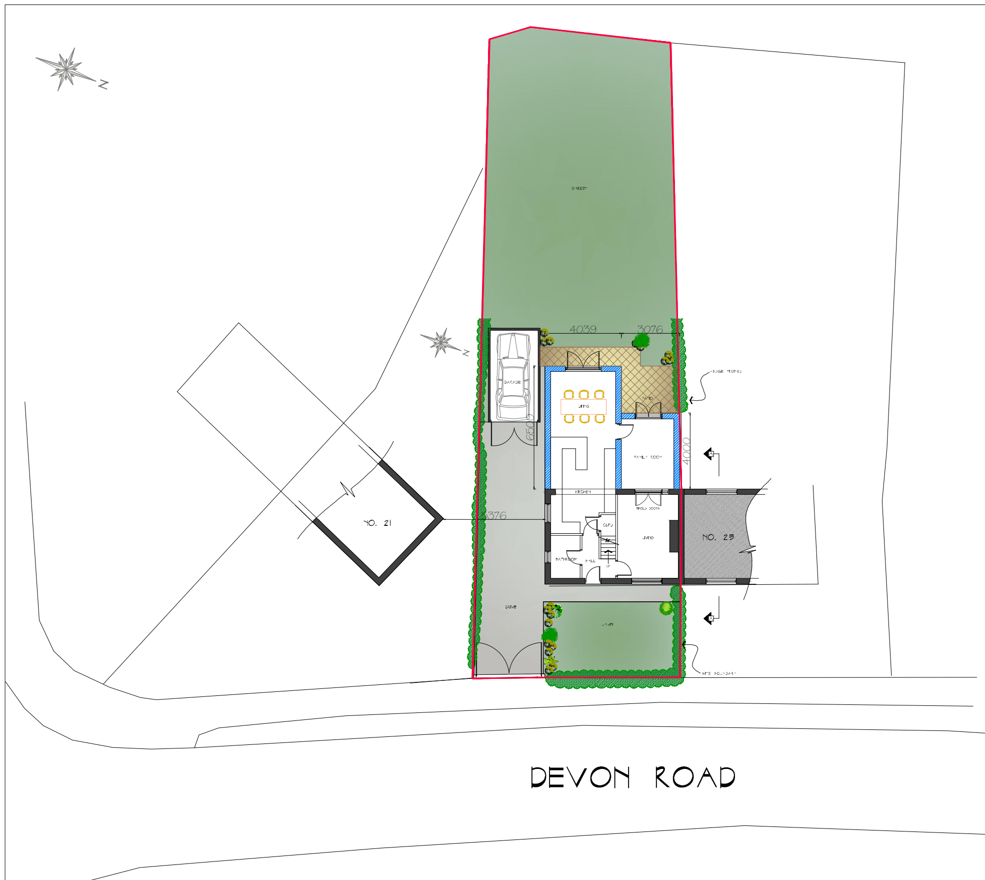
LOCATION AND BLOCK PLAN - 23 DEVON ROAD, BLACKBURN