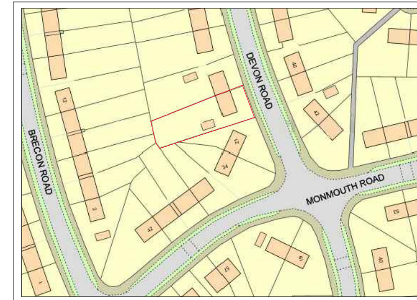
LOCATION PLAN SCALE 1:250